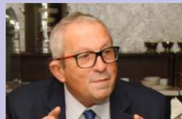
Joseph Sifakis Turing Awardee