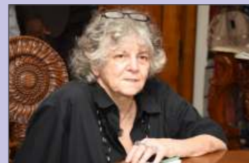
Ada E Yonath Nobel Laureate - Chemistry

Ada E Yonath, Nobel Prize winner for Chemistry, in her talk, expressed how delighted she was when she received an invitation from India as she had great learning experiences from the great scientist – Dr. G N Ramchandran an Indian physicist who was the first to propose a triple-helical model for the