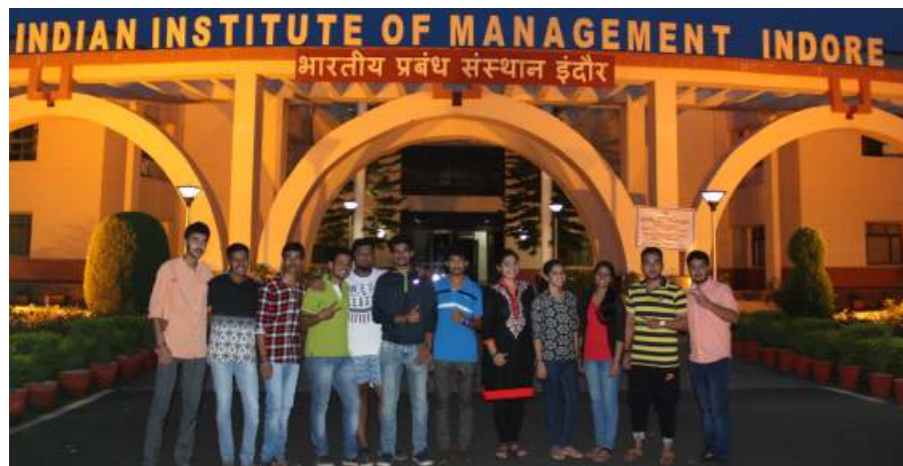
Twelve MBA Students participated in one of the biggest fest in Central India – Atharv 2017, the Cultural, Management and Literary fest of IIM Indore. Management and literary