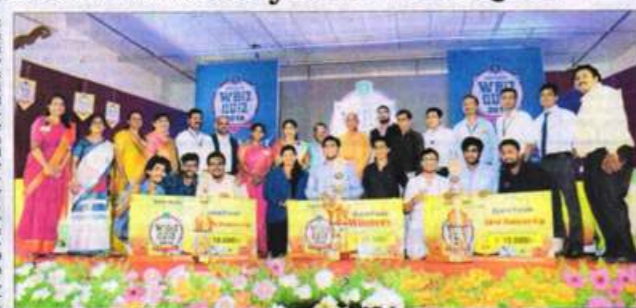
Winners of Sahyadri Whiz Quiz-2018 pose for a photograph.

MANGALURU: Department of Commerce, Manipal, won first place in the 'Sahyadri Whiz Quiz-2018' organized by the department of Business Administration of Sahyadri College of Engineering and Management. The winners received a trophy and cash prize of Rs 25,000. SDM, Ujire won second place with a trophy and a cash prize of Rs 15,000 while St Aloysius College, Mangaluru won 3rd place with a trophy and a cash prize of Rs 10,000. 'Sahyadri Whiz Quiz-2018' is an inter-collegiate quiz competition for undergraduate students. Around 7,000 students from 50 colleges in Mangaluru, Udipi, Kodagu, Karwar and Kasargod participated, of which 950 students were selected for the finale at Sahyadri College campus.