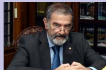
Serge Haroche Nobel Laureate - Physics